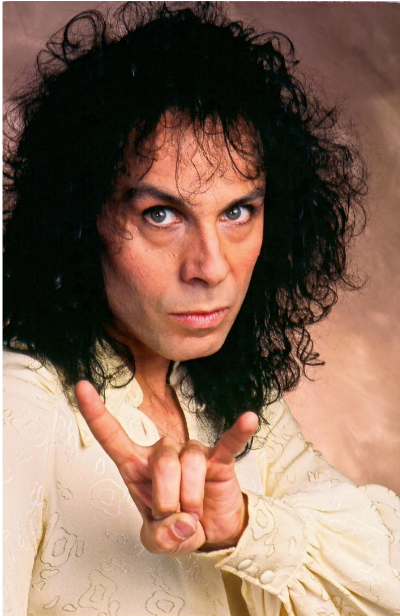
Ronnie James Dio