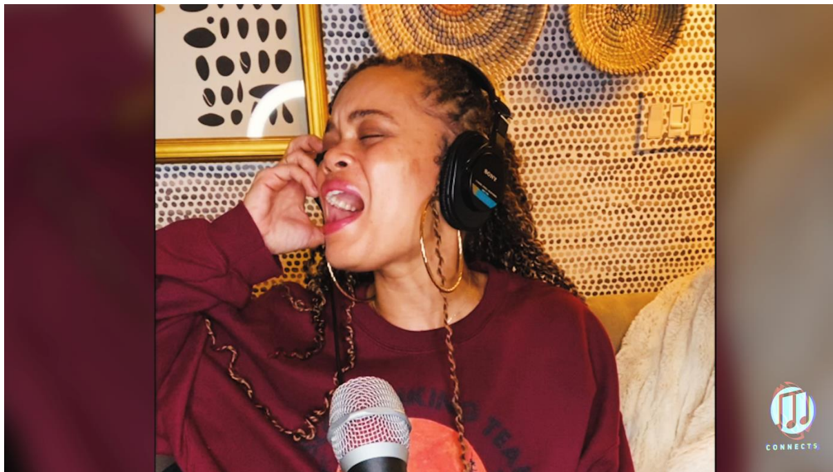
Andra Day performing "Rise Up" for Melodic Caring Project's rockSTARS who will view the MCPConnects episode while in quarantine in hospitals

Andra Day's MCPConnects episode can be viewed here: https://www.youtube.com/watch?v=-11ZJM_jGoQ