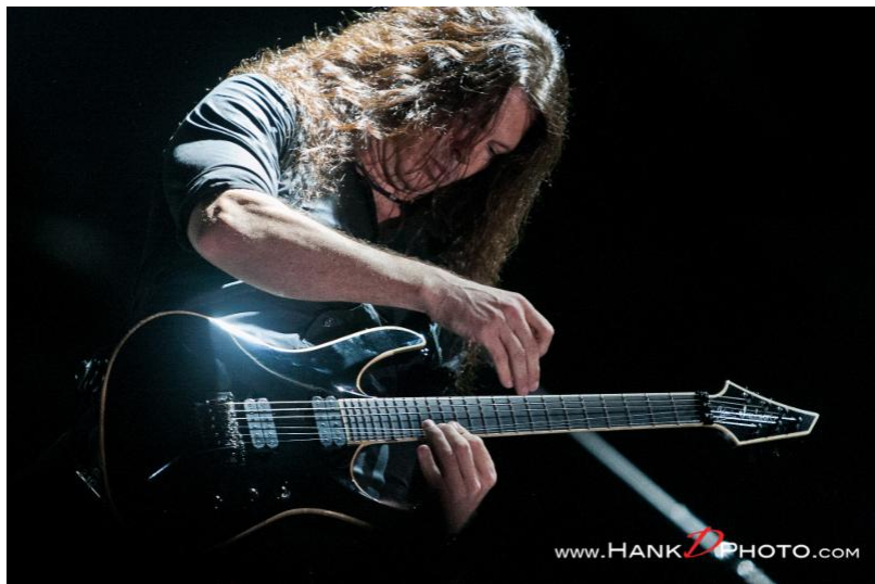
Chris Broderick on the 2012 Megadeth tour playing Jackson guitar to be auctioned at Bowl 4 Ronnie

The event kicks off at 6:30PM with open bowling and a VIP pre-party for lane sponsors, celebrities and their guests. Last year's BOWL 4 RONNIE drew artists such as Tom Morello, Lita Ford and Jack Black, fresh from his Grammy™ win for his version of Ronnie James Dio's song "The Last In Line" from the Dio tribute album, THIS IS YOUR LIFE. Proceeds from the sale of that double album were donated to the Dio Cancer Fund.